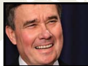
USA feature page 13 ▶

The Obama administration's new drug czar, R. Gil Kerlikowske, says he wants to banish the idea that the US is fighting "a war on drugs", a move that would underscore a shift favouring treatment over incarceration in trying to reduce illicit drug use.